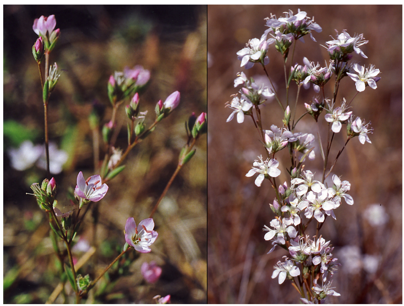
Large-flowered forma - Nicasio Ridge. Highly-congested influorescence forma - Mt. Burdell.

U.S. Fish and Wildlife Service Sacramento Fish and Wildlife Office Sacramento, California